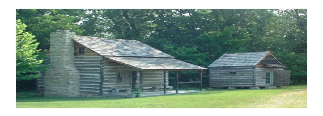
Visit to Local Museums Planned for Friday, September 20th

Have you lived in the Lake of the Ozarks area a long time or are you new to the area? Did you know that there are local museums with displays about the history of the local area, Bagnell Dam, and Lake of the Ozarks? Our 55 Alive committee has planned a visit to two of our local historical locations. On Friday, September 20<sup>th</sup>, we will meet at church at 10 a.m. We will either take the church van or carpool to the Miller County Historical Museum located in Tuscumbia. It has displays about the history of our area, the Civil War, local schools and churches, among other items. When we are finished in Tuscumbia, we will stop at the Silver Dollar's Restaurant for lunch. Our next stop will be the Willmore Lodge Bagnell Dam Museum. We will then return to church about 2 p.m.