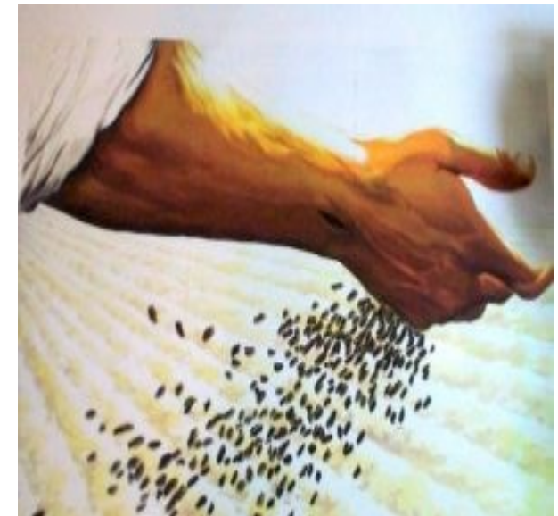
The Parable of the Growing Seed

The mission of Lake Ozark Christian Church is to provide a spiritual environment for persons of all ages, walks of life and prior religious affiliations. Celebrating open communion, empathy and love, we strive to serve our community and people throughout the world in accordance with the principles taught us by Jesus Christ, our Savior.